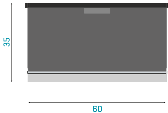
FRONT VIEW [CLOSED]